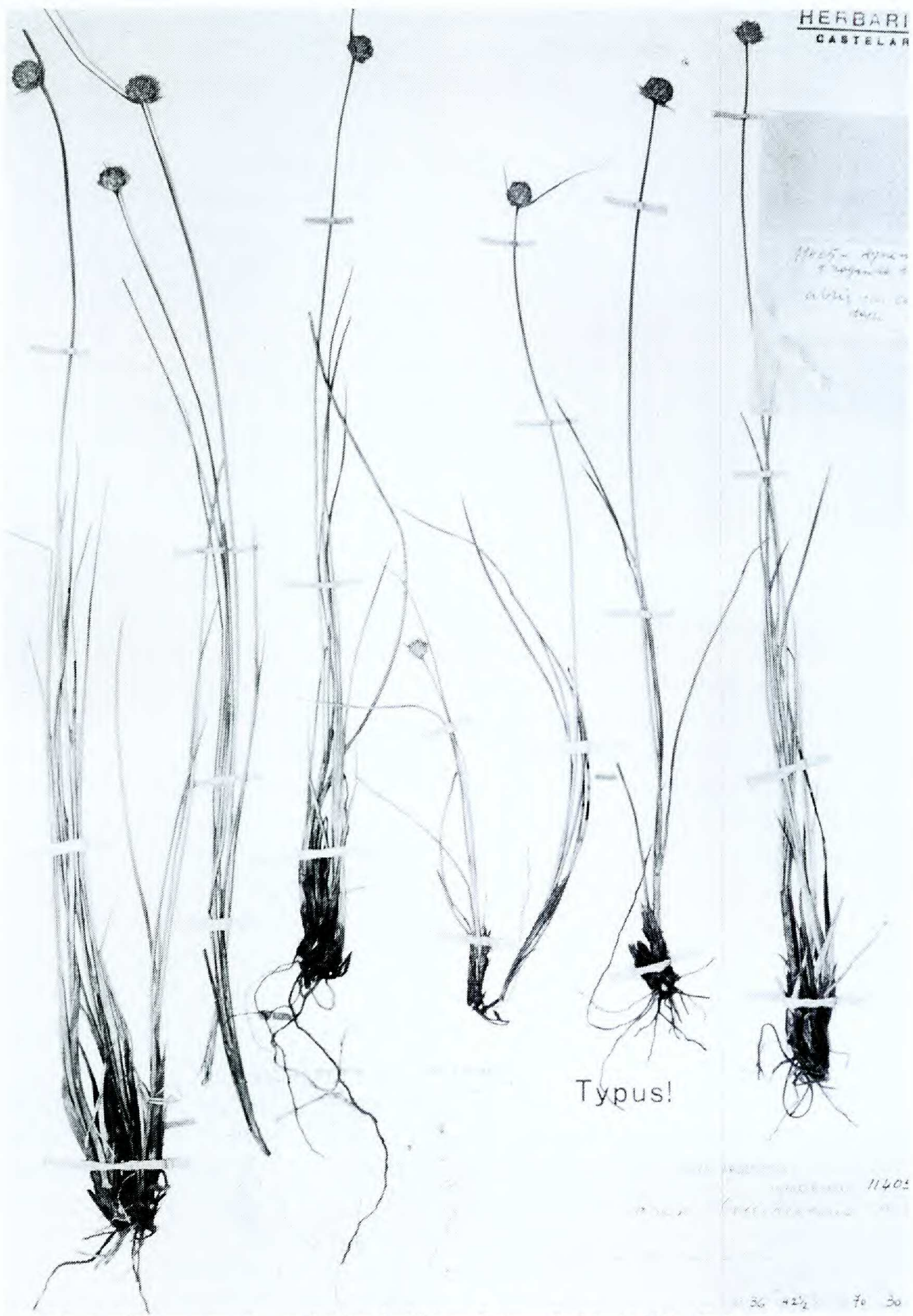
FIG. 2. Holotype specimen of Carex boelckeiana Barros (Boelcke 11405). Herb. BAB.